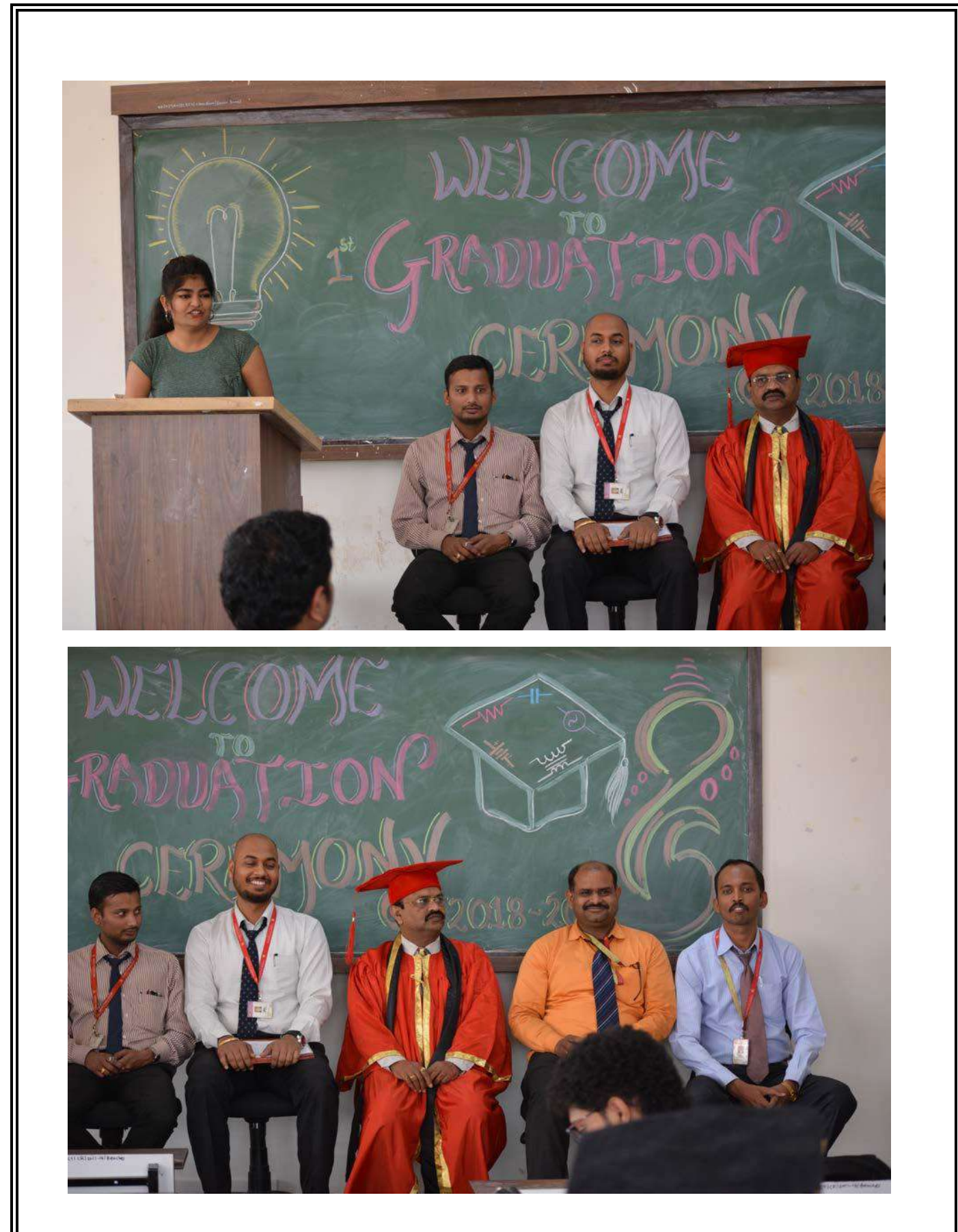
Electrical Engineering Department Staff were present for 1st Graduation ceremony