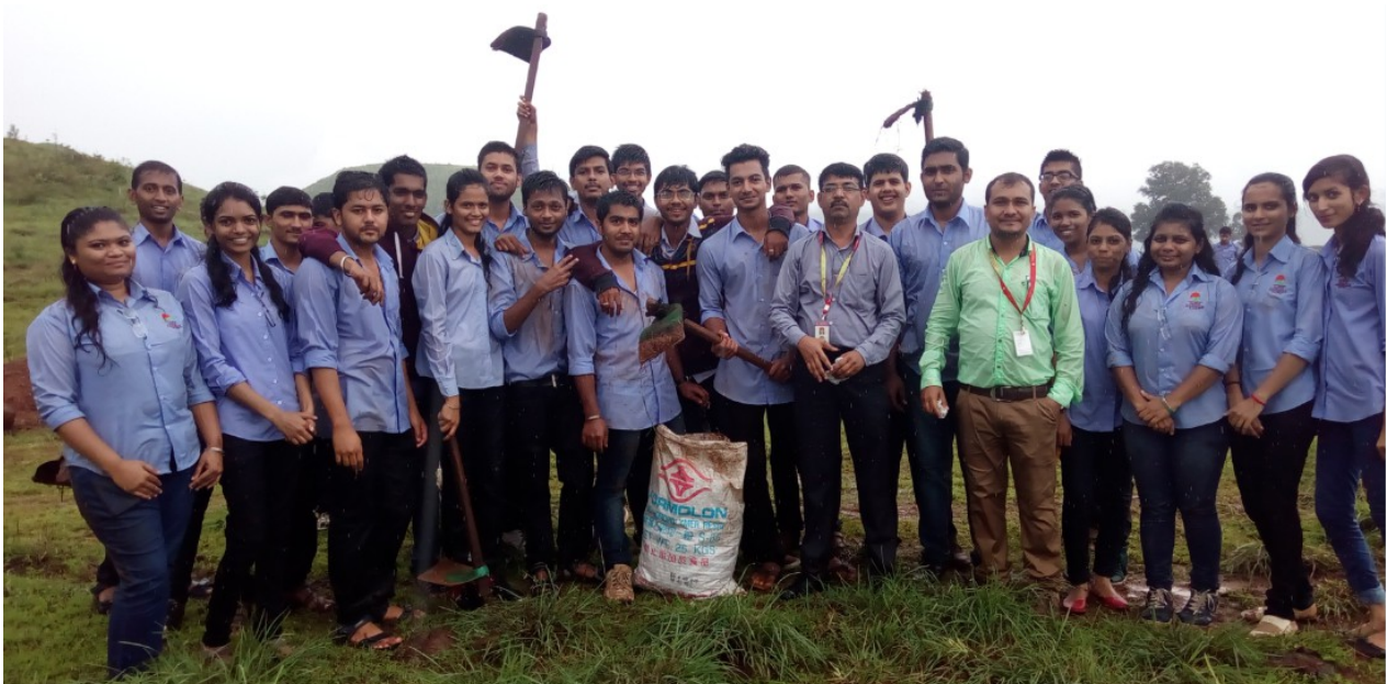
The team of tree plantation