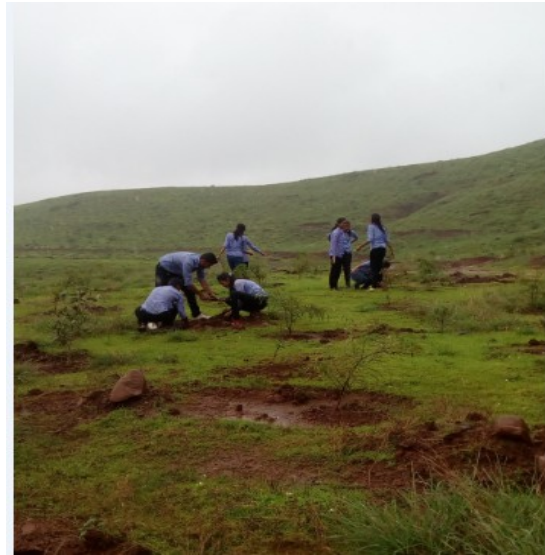
Student volunteers doing the tree plantation