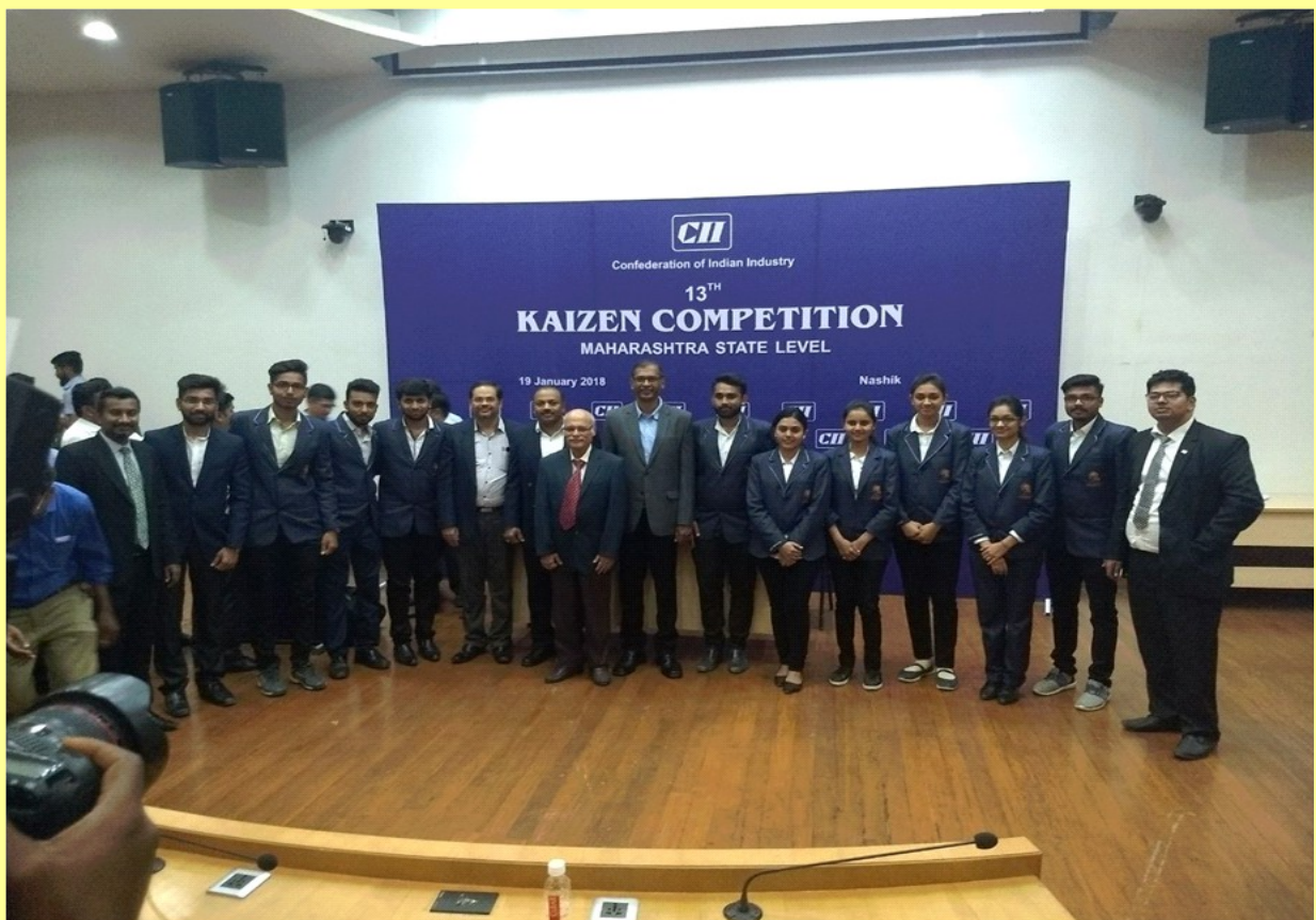
Students with Delegates at CII Kaizen Cmpoetition