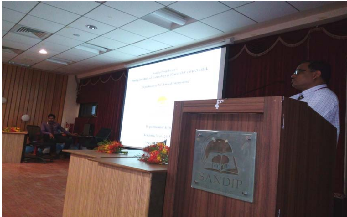
Hands on Session on “ Functions,Shortcuts and Time Saving Techniques using Scientific Calculator 82 MS, 100 MS, 991 MS, 991 ES, 991 EX”