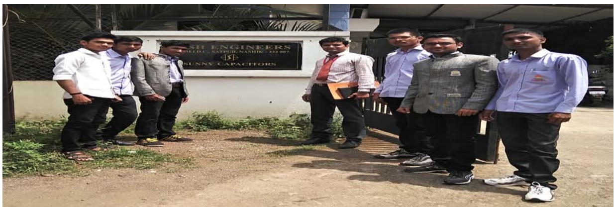
Electrical Engg Dept Staff and Students of Sandip Foundation,SITRC @ Sunny Capacitors Pvt Ltd

This industrial visit was very successful and students will have definitely an added advantage of practically observing the process of Manufacturing , Testing and Working of the Capacitors and what are the materials required for the manufacturing of Capacitors.