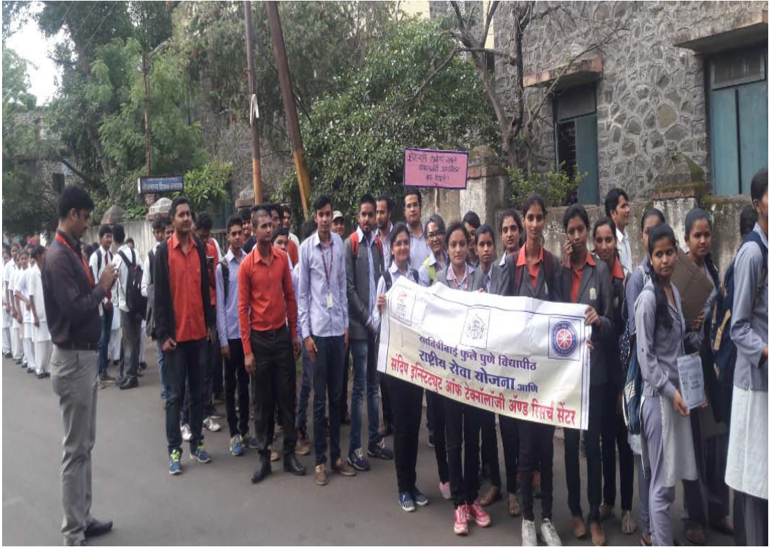
Organ donation rally on 30 th August 2016