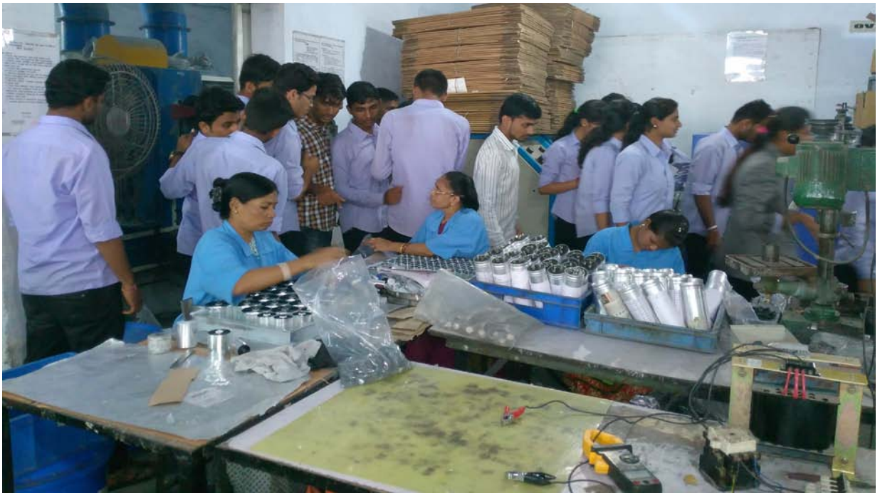
SE Student observing the process of Manufacturing of Power Capacitors