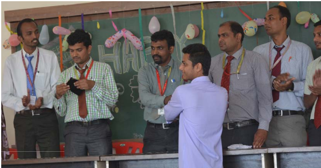
Cake Cutting Ceremony