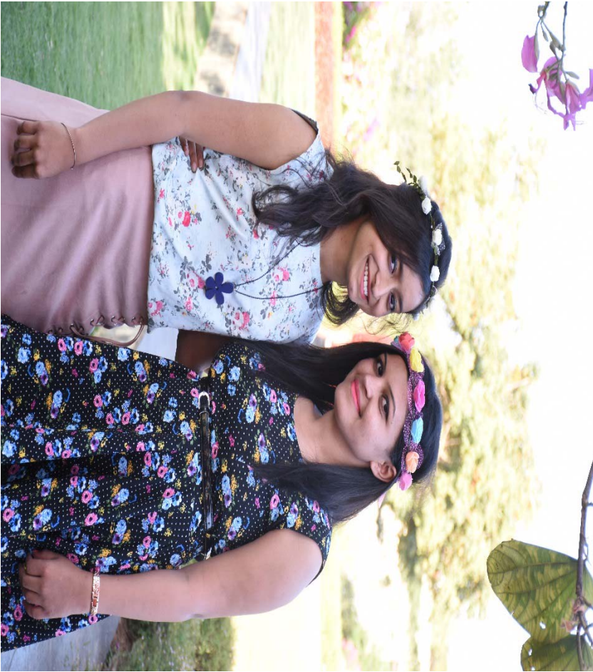
4) Neon Day